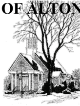
Trinity Chapel 1901 State St.