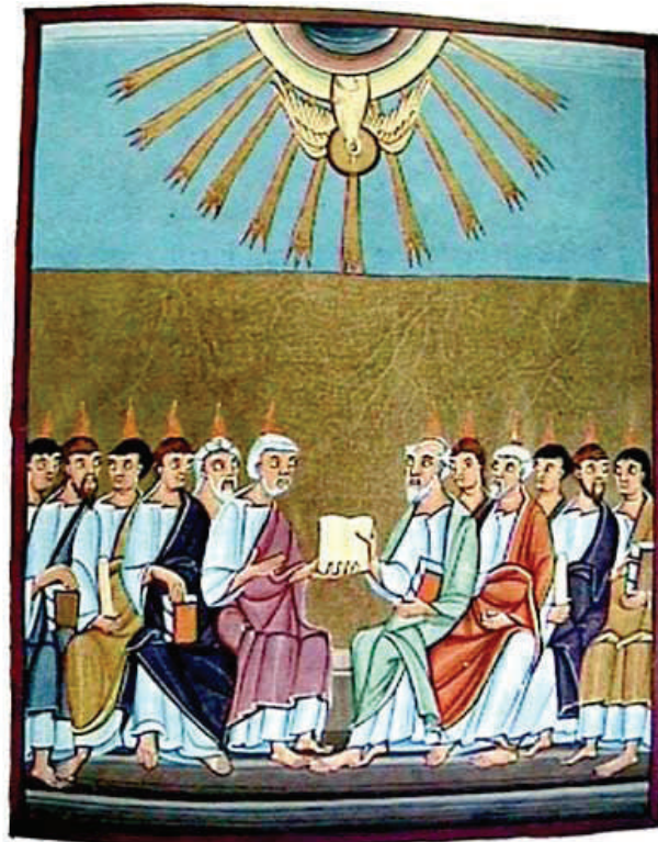
Illustration: a page from the Gospel Lectionary portion of the Bamberg Apocalypse